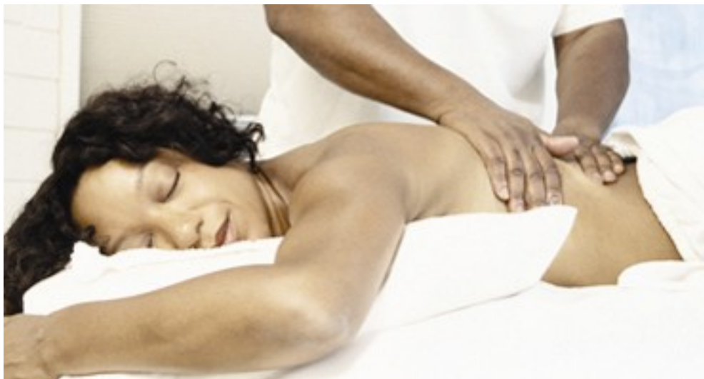
Massage induces a sense of grounding and calm, helping you face challenges with ease.