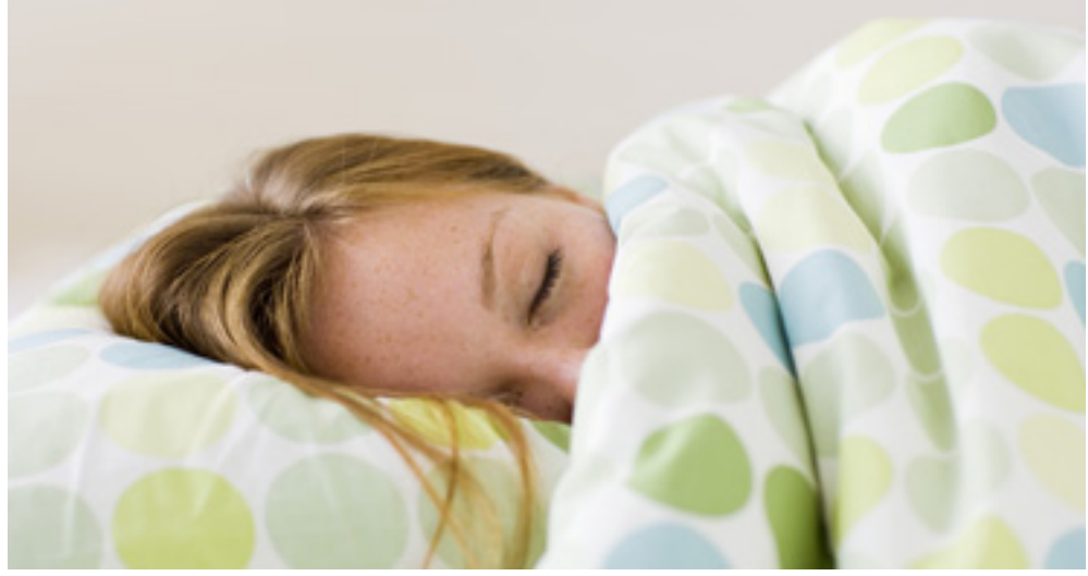
You know you're supposed to get your eight hours!